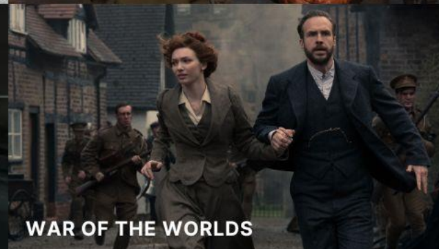
WAR OF THE WORLDS