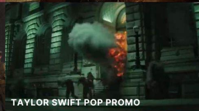
TAYLOR SWIFT POP PROMO