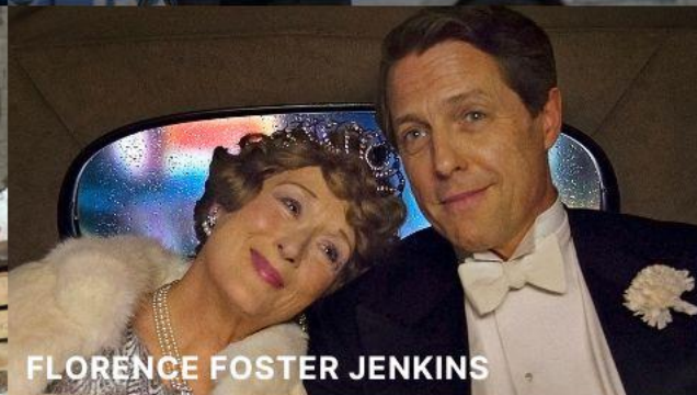
FLORENCE FOSTER JENKINS