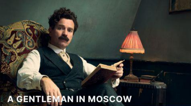
A GENTLEMAN IN MOSCOW