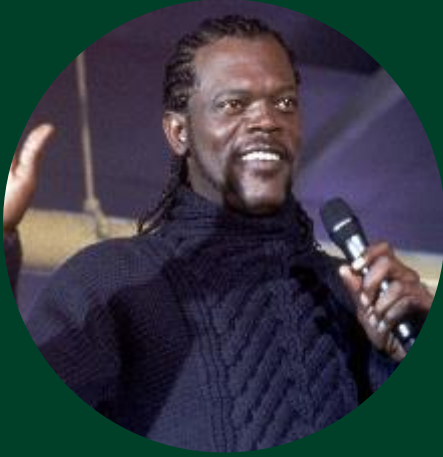
Samuel L Jackson

“Liverpool is a great place. The people are so cool, so supportive and so helpful, and the city is so much fun.”