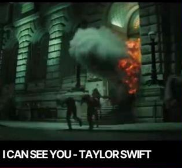
I CAN SEE YOU - TAYLOR SWIFT